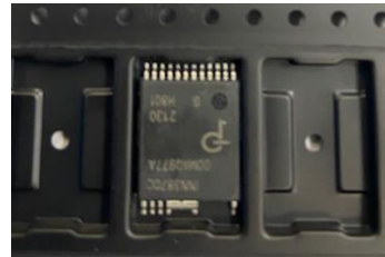
New Pocket Design with Corner Relief